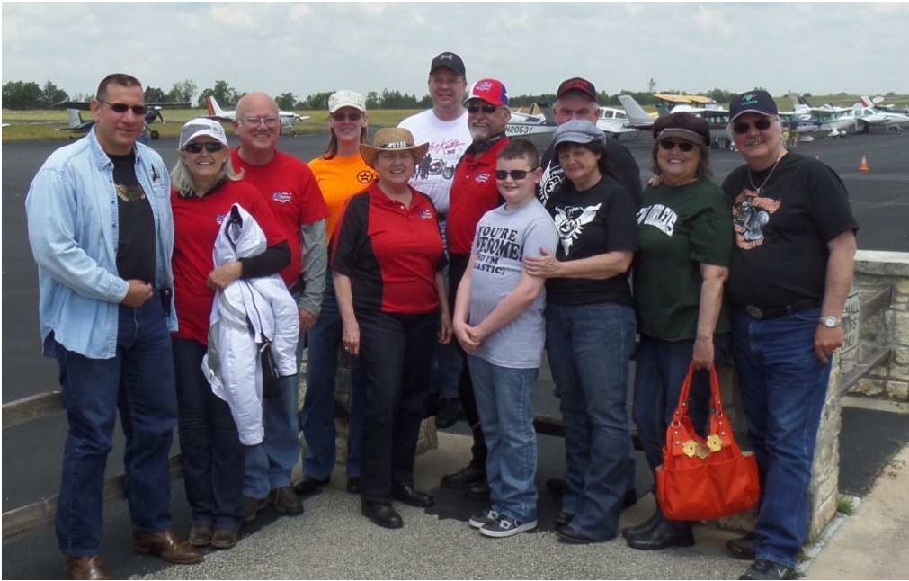
Chapter C needed a group shot so I helped out