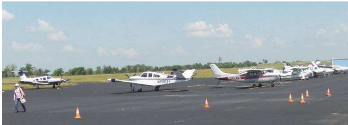
We made it to the Southern Flyer Diner.. Pretty easy to understand why it is called the Flyer Diner