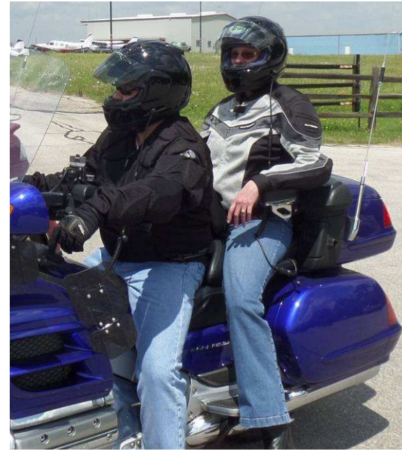
Take me to your leader. Oh, you are the leader.