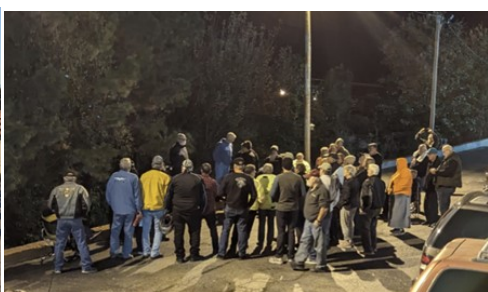
Line up to ride at parking lot next to the Hotel and meeting outside for 50/50