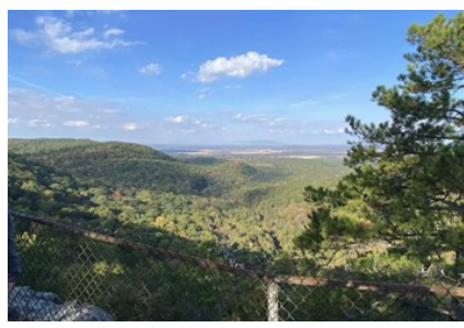
Cemetery in Harrison AR and a view from Hwy 7