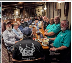
Ralph & Kacoo's, Lufkin