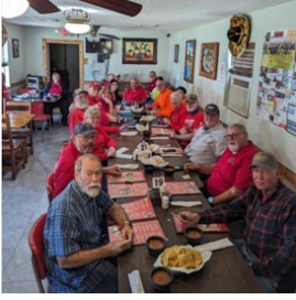
Celebrating Al's Birthday